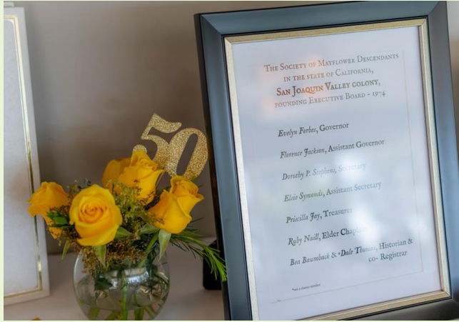
On display- Left: 1974 Executive Board Right: Colony Charter